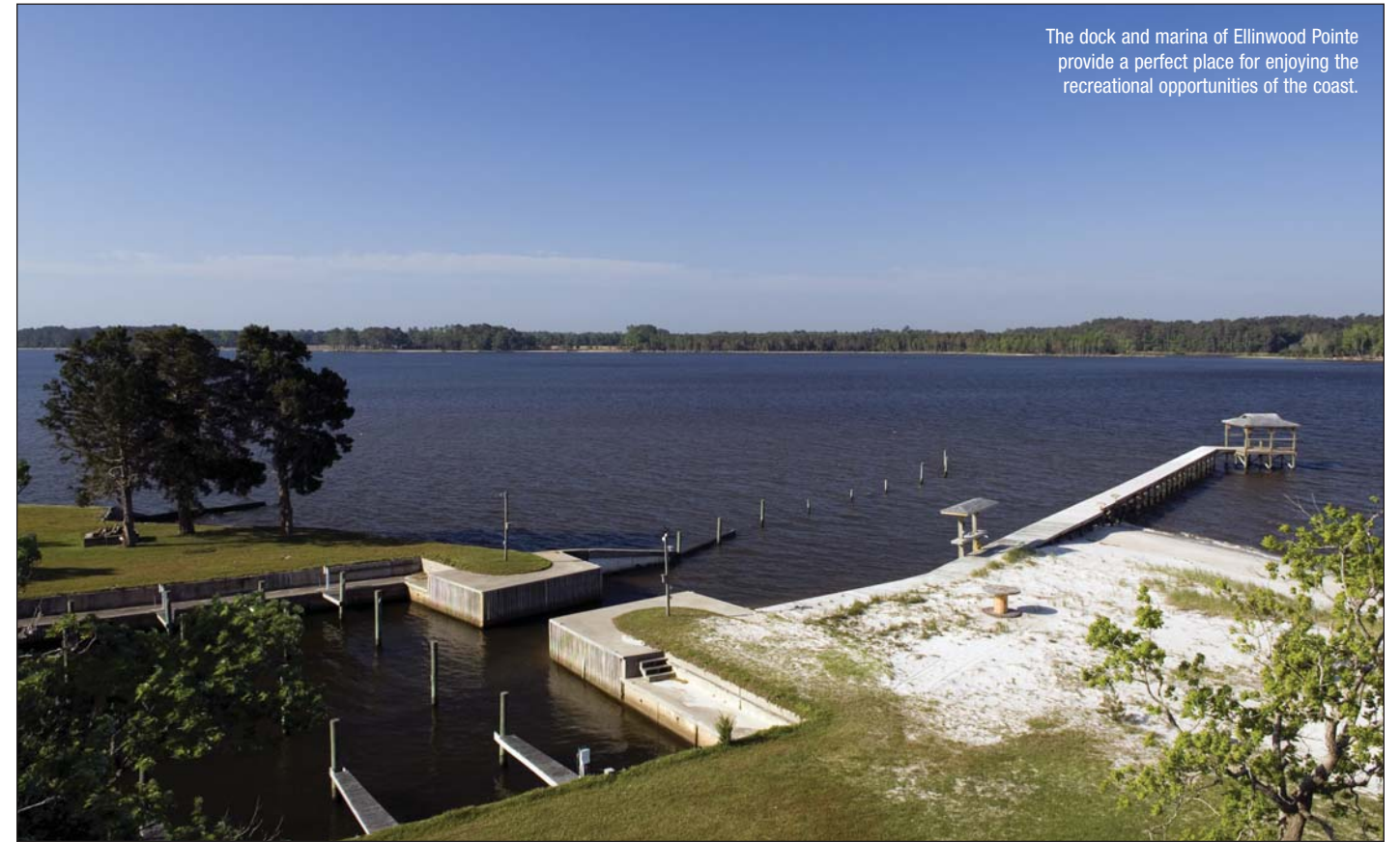
The dock and marina of Ellinwood Pointe provide a perfect place for enjoying the recreational opportunities of the coast.

Nestled at the confluence of Adams Creek and the Neuse River, Ellinwood Pointe is an ideal neighborhood community for water lovers, families, retirees or those looking for a second home or an investment. Residents can take advantage of the private concrete boat launch ramp and marina, which will accommodate 25-foot to 40-foot boats. Designated parking