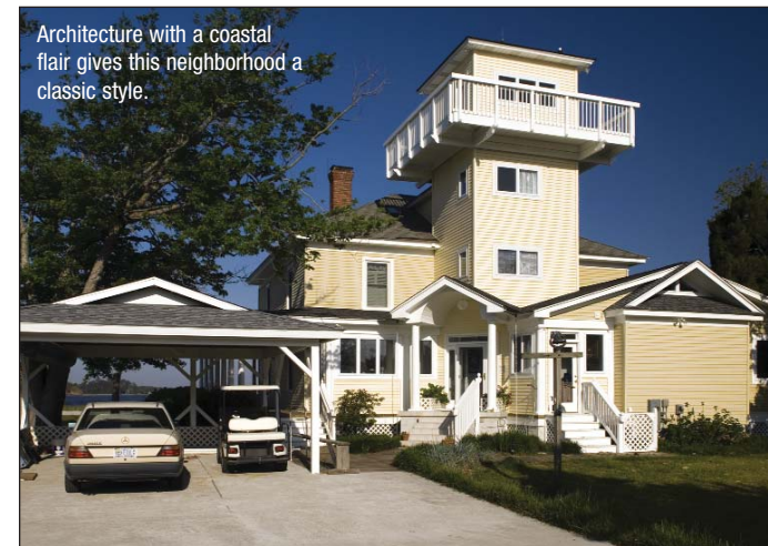
Architecture with a coastal flair gives this neighborhood a classic style.

and storage areas will be available for seasonal trailers and boats. Next to the maintained marina channel, Ellinwood Pointe boasts a 360-foot dock that leads to deep water of the ICW, providing a great place for loading up passengers, hanging out with a fishing pole or crabbing with the grandchildren.