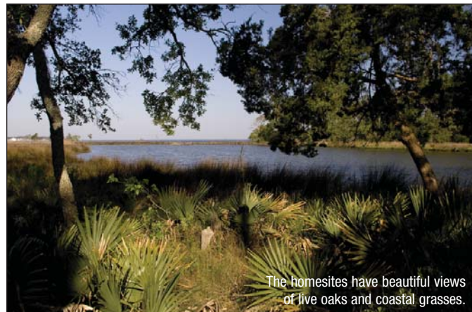
The homesites have beautiful views of live oaks and coastal grasses.

Ellinwood Pointe is made up of 86 homesites in three phases, each with a beautiful view of the waterfront, surrounding freshwater ponds and marshes, as well as the breathtaking sunsets each evening. The protective covenants call for a traditional Carolina Low-Country coastal design, natural-colored exteriors in keeping with the surrounding environ-